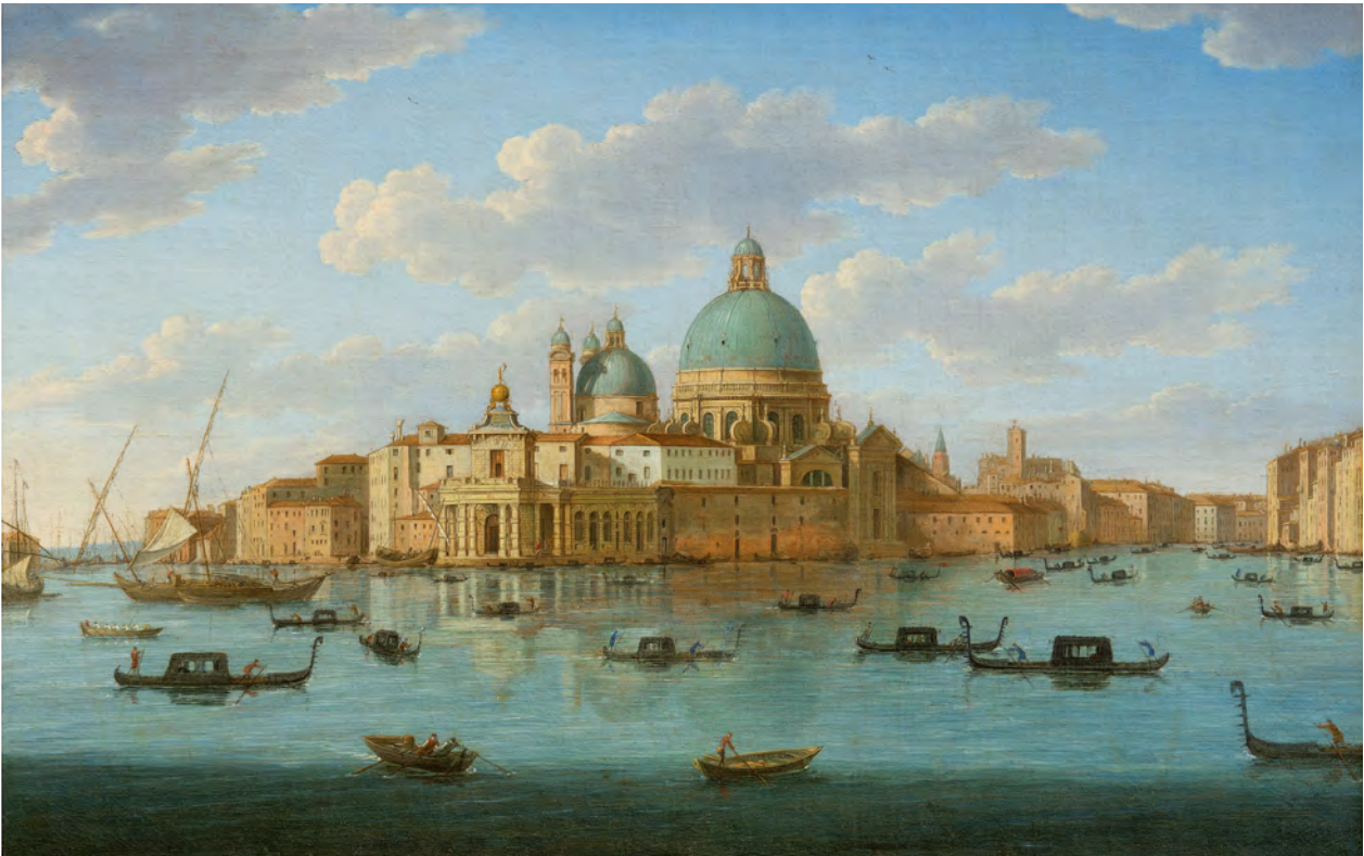
HENDRIK FRANS VAN LINT ( Antwerp, 1684 - Rome, 1763 ) Church of Santa Maria della Salute with Punta della Dogana, ca. 1750 Oil on canvas, 46.5 x 71.5 cm Intesa Sanpaolo Collection Gallerie d'Italia - Palazzo Leoni Montanari, Vicenza

Van Lint's view of the Church of Santa Maria della Salute with Punta della Dogana belongs to the Intesa Sanpaolo's 18th century Venetian art collection, which is part of the permanent exhibition at Gallerie d'Italia - Palazzo Leoni Montanari, the Bank's museum venue in Vicenza.